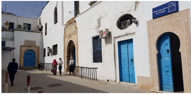
The Aziza Othmana university hospital

Photographs of the branch office and city where the branch is situated: